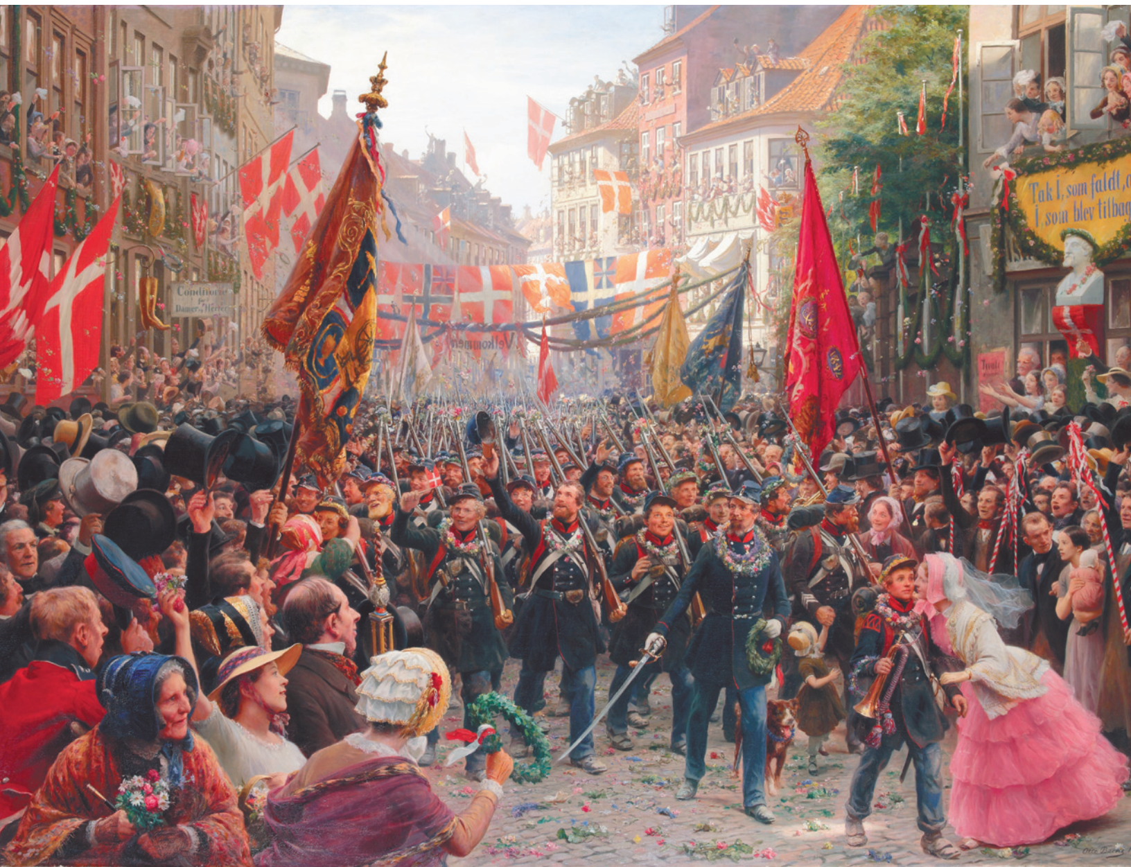
Otto Bache, Soldiers Returning to Copenhagen, 1894 .

SPRING 2014 + ANNUAL REPORT | A BENEFIT OF MEMBERSHIP TO THE MUSEUM OF DANISH AMERICA